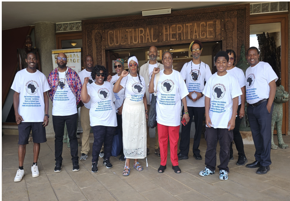
Tanzania Roots & Culture Tour Nov 2023