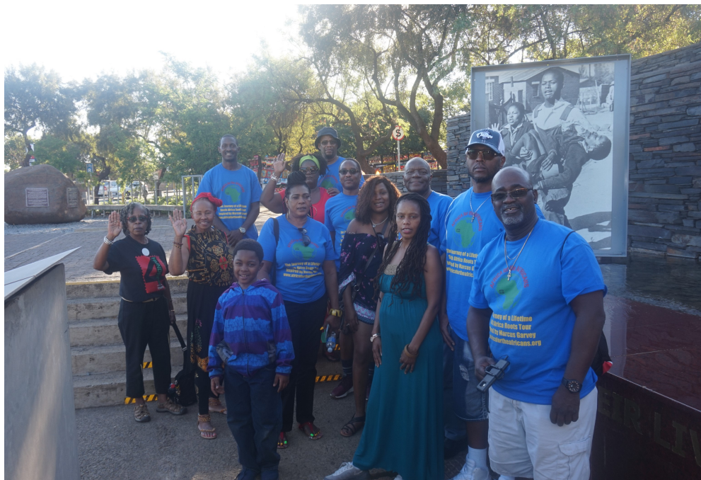
South Africa Roots & Culture Tour Nov 2019