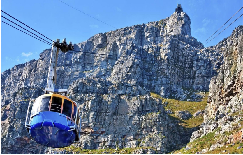
Table Mountain is a flat-topped mountain forming a prominent landmark overlooking the city of Cape Town in South Africa. It is a significant tourist attraction, with many visitors using the cableway or hiking to the top.[ The mountain forms part of the Table Mountain National Park, and formerly part of the lands ranged by Khoe-speaking clans, such as the (High clan), and is therefore known aboriginally. It is home to a large array of fauna and flora, most of which is endemic.