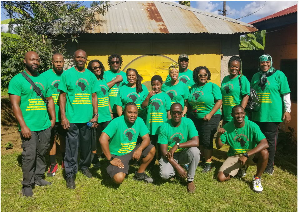
Tanzania Roots & Culture Tour Nov 2020