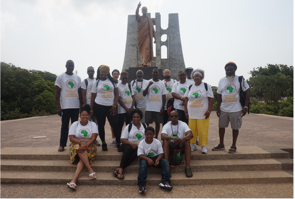
Ghana Repatriation and Investment Tour Dec 2020